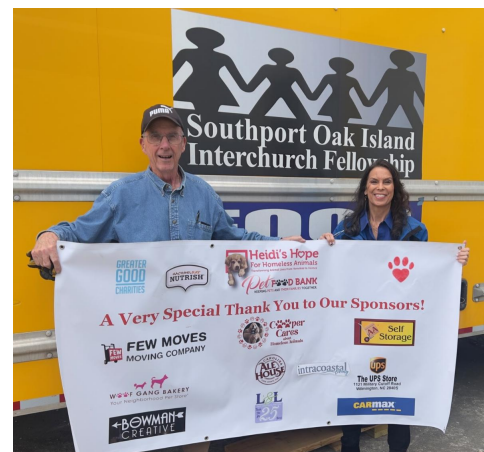
Southport Oak Island Inter-Fellowship Food Pantry