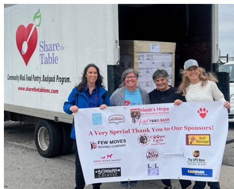
Share the Table Pender County