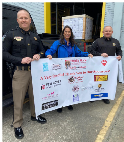
Brunswick County Sheriff's Office Animal Shelter