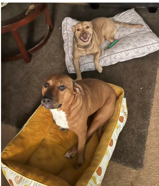
Beds, Besties, Bliss