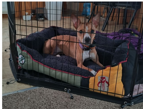
Pampered in Pet Bed Paradise