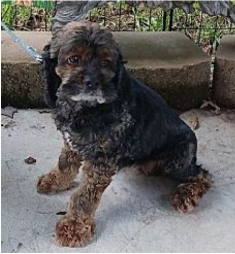
Sophie's Adoption Photo Her eyes show she has been longing to be loved